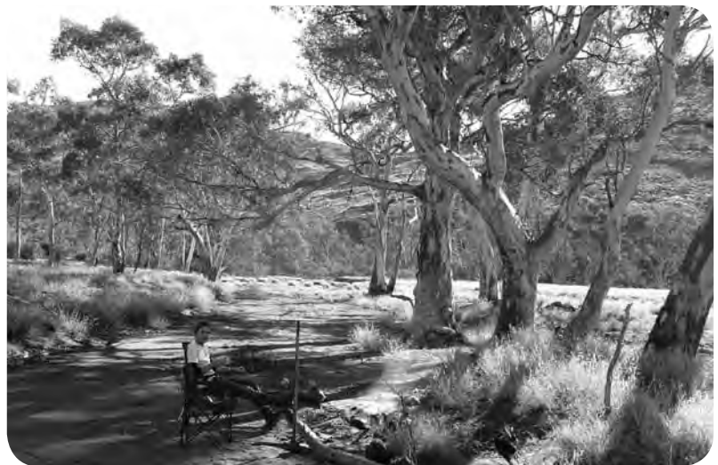
Camping near Ernabella (Pukatja).