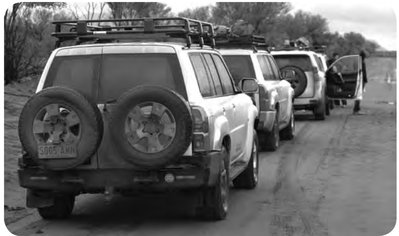
Mulga Park Road on the way to Amata

It is a privilege to be permitted to travel to these Lands.